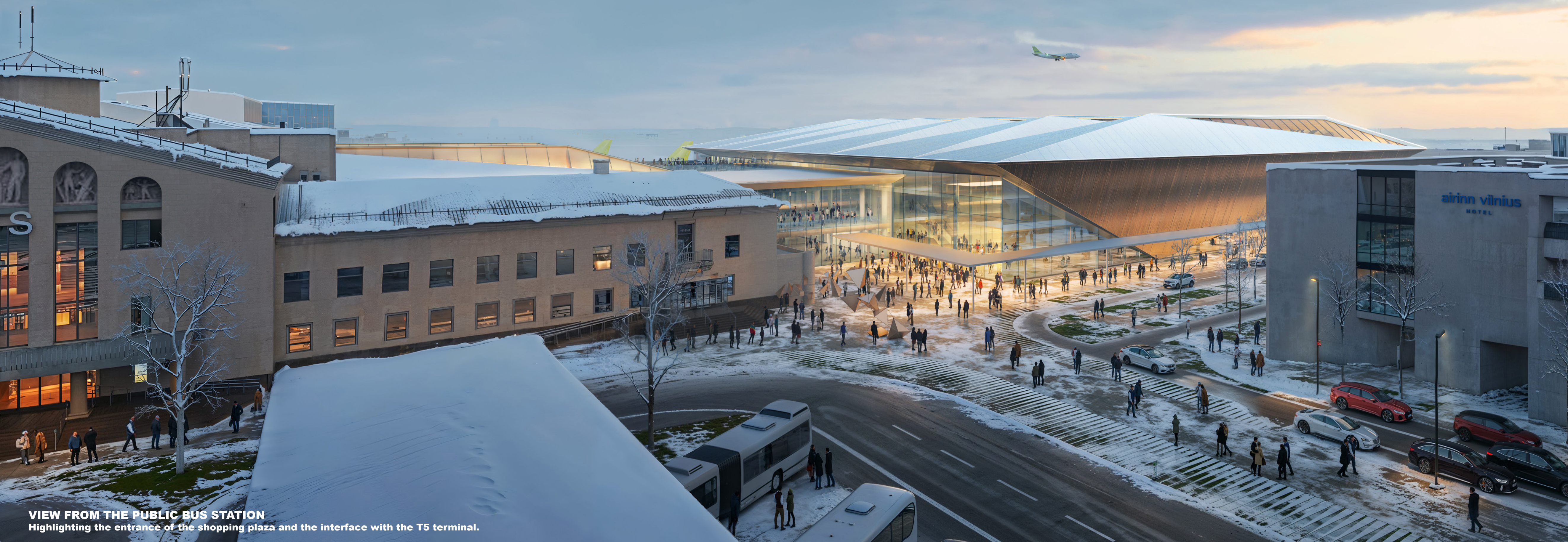
VIEW FROM THE PUBLIC BUS STATION Highlighting the entrance of the shopping plaza and the interface with the T5 terminal.