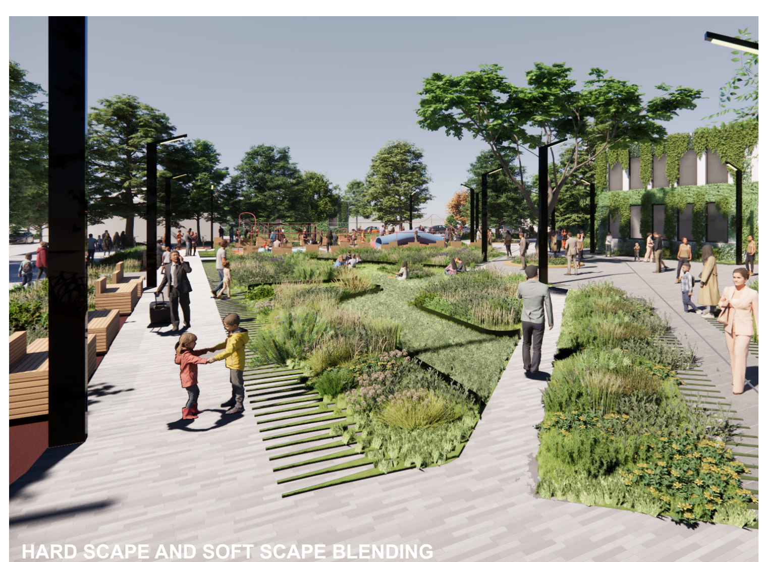
HARD SCAPE AND SOFT SCAPE BLENDING